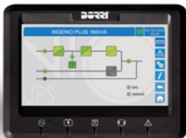
*Optional touch screen display (on 60-160 kW UPS)